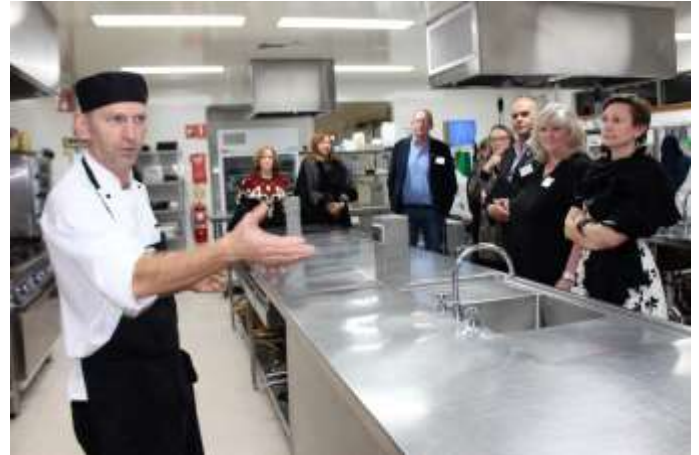
Vocational Visit to Graduates Restaurant at St. Johns Regional College, Dandenong.