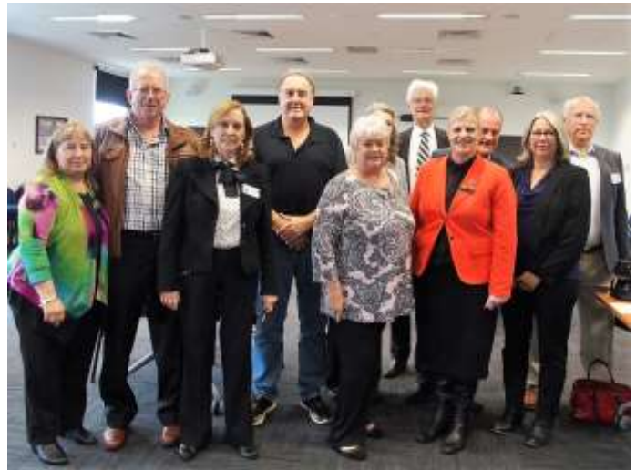
Some of the team that conducted mock interviews at Nossal High School

Rotaract Clubs are set up to give 18 to 30-year-olds an avenue for service in partnership with Rotary Clubs. Being a member of Rotaract allows young people to serve their Community whilst making like-minded friends.