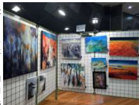
Our Artscreens in use at Nossal High School