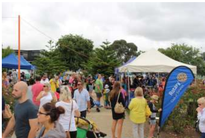
Big crowds attended our 2017 Australia Day event