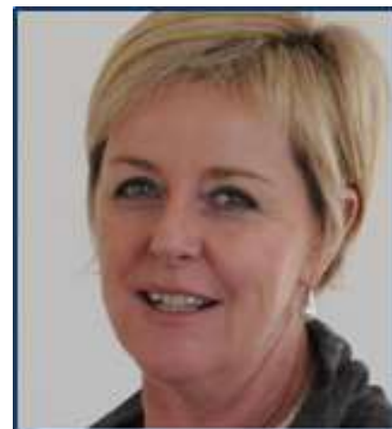
Director: Jane Moore

The specific vision was to build on the good work of the previous committee; additionally to achieve uniform branding and to ensure current and consistent contact details across all media, to link our weekly bulletin to social media sites, to have effective cloud storage of club photographs, to work collaboratively with and support other directorships, to develop a suite of public display materials for use at all our activities and to form policy on the publishing of photographs with consent.