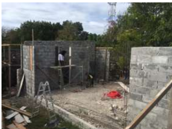
Balibo Conference Centre taking shape