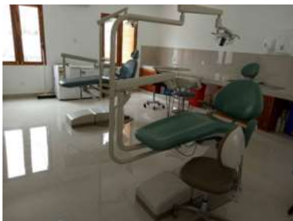
Inside the new Balibo Dental Clinic

Work in Balibo, Timor Leste has been progressing well. The Rotary Club of Berwick, Pakenham, Port Melbourne and Keilor have been working together through Rotary Donations in Kind (DIK) and RAWCS to provide a Dental Clinic.