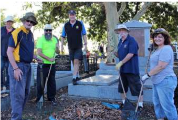
A team to die for at the 2017 Berwick Cemetery Clean-up