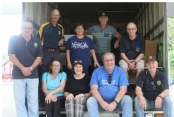
Relaxing after another load of furniture for DIK

The Board has approved a $500 ongoing donation to DIK to contribute towards the lease costs of the DIK warehouse.