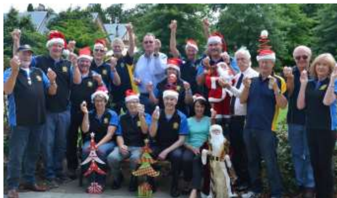
It takes a big team to run the Carols by Candlelight Event

Club sponsorship is another component of fundraising. Thank you to St John of God Hospital Berwick and the Bendigo Beaconsfield District Community Bank. The City of Casey again has been a great support for our community events.