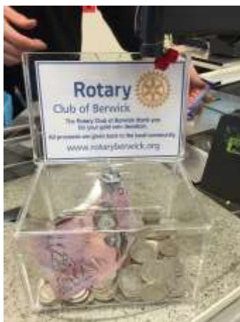
New Coin Collection Boxes at Coles

Another of our regular annual projects, the event this year was a success and included one of the 'Oarsome Foursome' as a guest speaker at the post game dinner. While under budget it was well supported by local business.