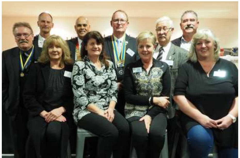
L to R in Photo