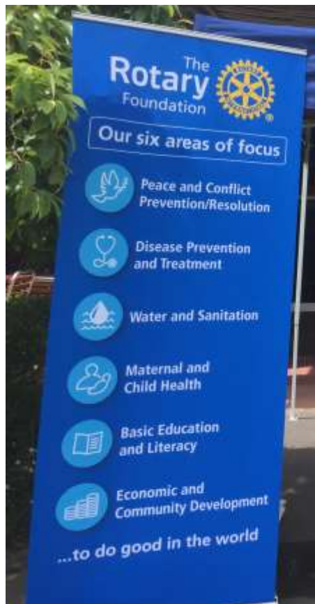
One of our new pull up signs

Encouragement has been given for the Rotary Club of Berwick to showcase in an article to be submitted to Rotary Down Under magazine. Viv and Isobel have run with this and are working on submissions. An opportunity was also given for the club to enter photographs to Rotary Australia Public Image for use in their promotions.