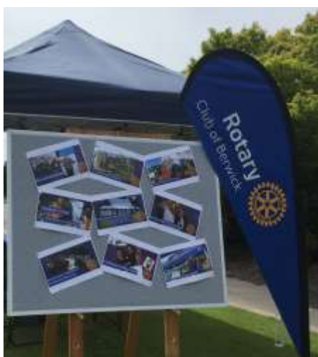
New Display Board and Teardrop Banner